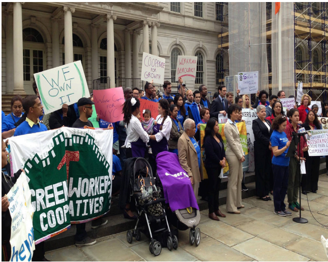
Ecomondo Cleaning Cooperative

paradigm. This means “going big” to integrate and scale the model: integrate , by intentionally weaving together a growing patchwork of institutions, activities, and constituencies to create a new self-conscious politics of community; and scale , by moving out of the narrow lanes of economic development and into across-the-board economic policies and strategies, mobilizing the full weight and resources of the local public and nonprofit sectors for community stabilization, development, and well-being.