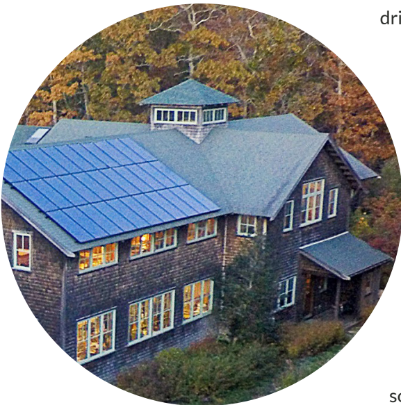
Headquarters of South Mountain Company

Are mission-controlled, employee-owned companies better environmental stewards than conventional finance-controlled corporations? Is transitioning to employee ownership a more likely path to keeping a firm's ecological mission alive, compared to selling a firm to a large competitor? The answer to these questions is critical to enterprise design for the 21st century and beyond. If we understand the relationship between enterprise design and a sustainable, equitable economy, we can be more deliberate in the choices we make. To illuminate this issue, the Fifty by Fifty project has prepared a series of company profiles, with support from Partners for a New Economy.